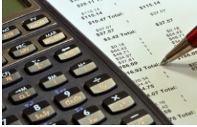
Accounting Class. Info.