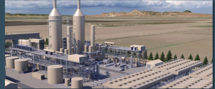
Calpine's Sutter CCS rendering