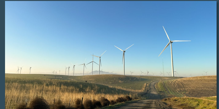
Solano Wind Farm