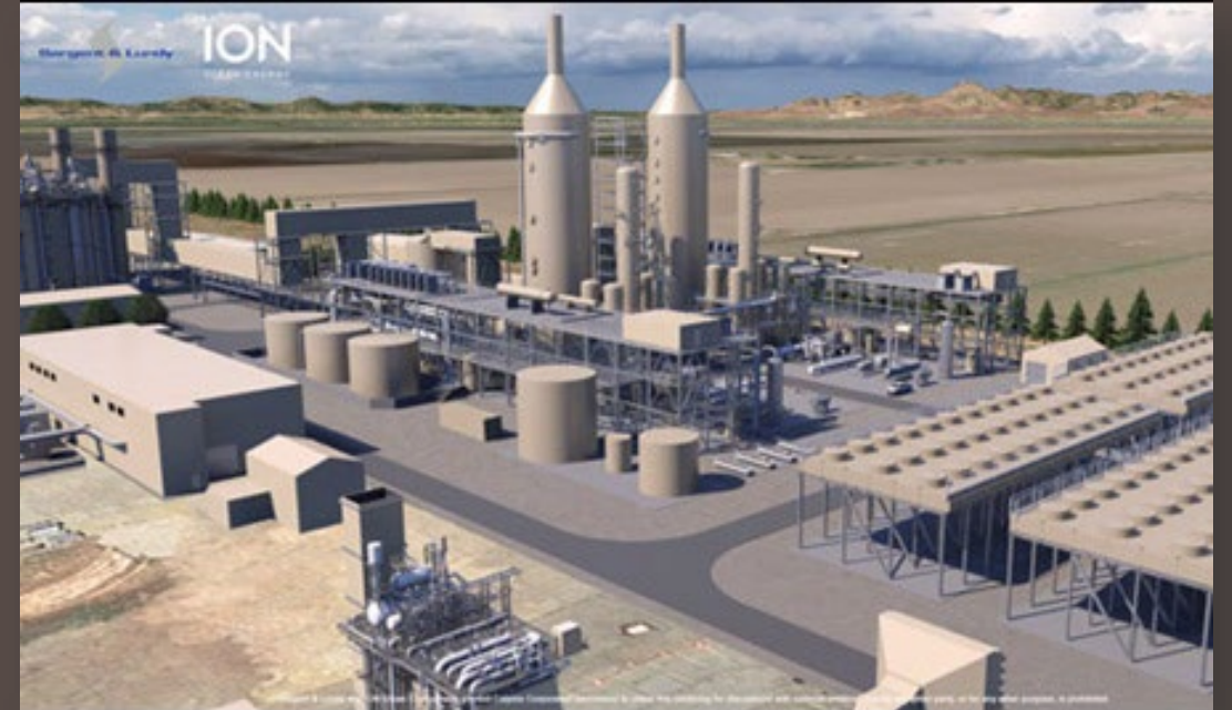
Rendering of Calpine's proposed Sutter Energy Center project.