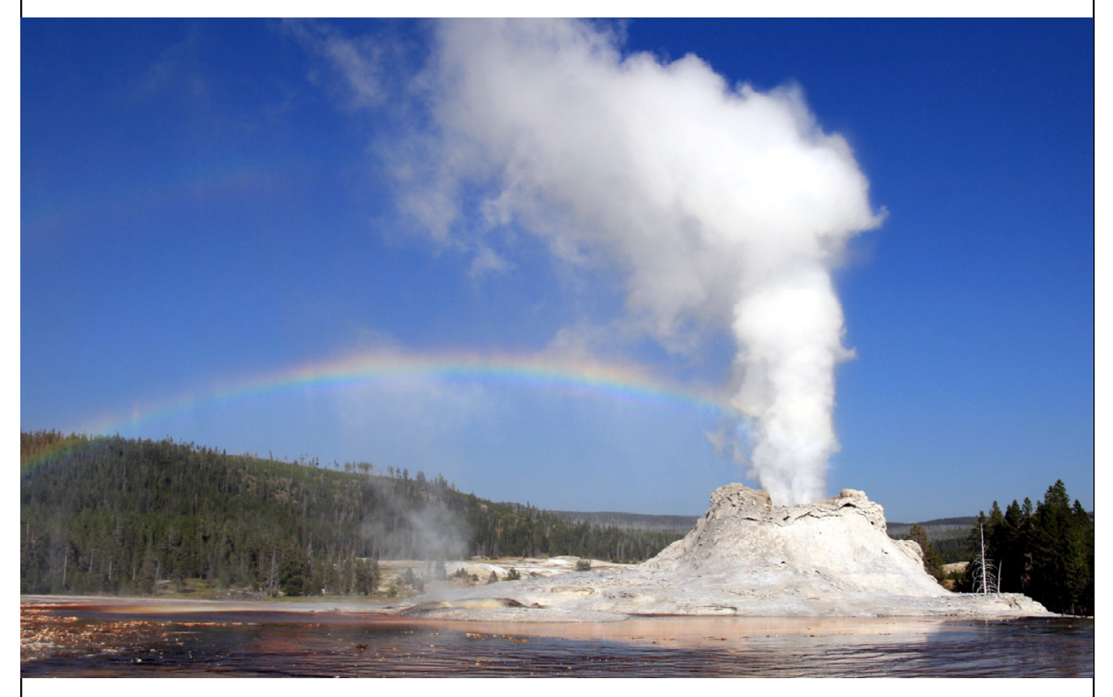
A geyser releases hot water and steam into the air.

Geothermal energy is heat inside the Earth. Geothermal energy is renewable.