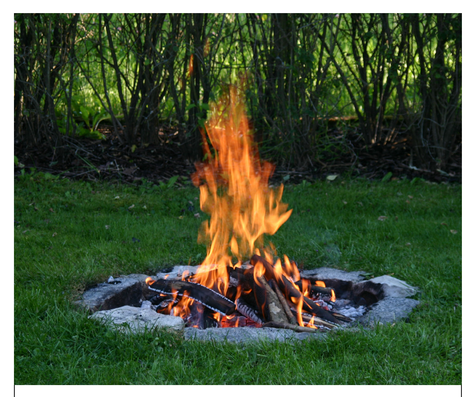
Wood is biomass.