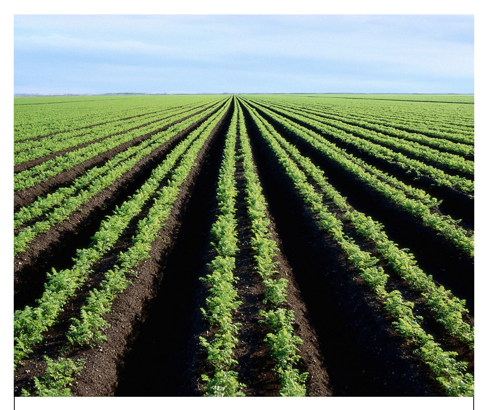
Crops are biomass.