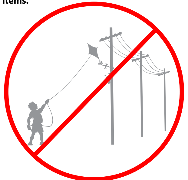
Do not play or climb trees near power lines. Do not touch a fallen power line.