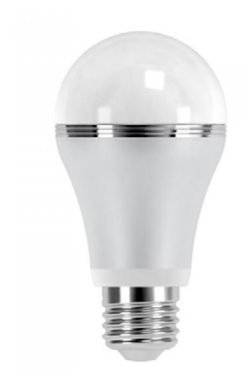
Light Emitting Diode (LED) Light Bulb