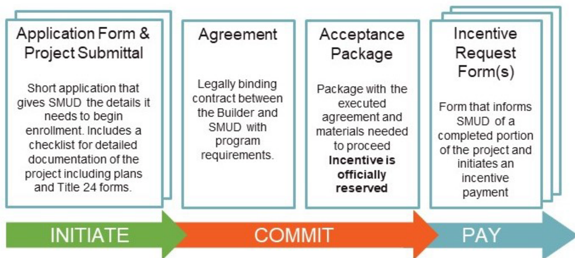
Figure 2 – Project Lifecycle and Smart Homes Documentation for Larger Developments

The Smart Homes application and incentive process can be completed in four steps for larger development projects: