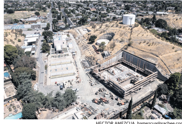
Gov. Gavin Newsom visited the Antioch Water Treatment Plant on Thursday to announce a water supply strategy for a hotter and drier California. The city's Brackish Water Desalination Project, the first desalination project to be built in the Delta, is under construction at right.

But Newsom's administration believes California needs to improve storage above and below ground — as climate change turns the state hotter and drier. The Sierra Nevada snowpack which acts as a second set of reservoirs, capable of releasing water during the \overline{dry} months — is already diminishing as rain replaces snowfall. That makes it more vital for California to capture and store precipitation when it does fall,