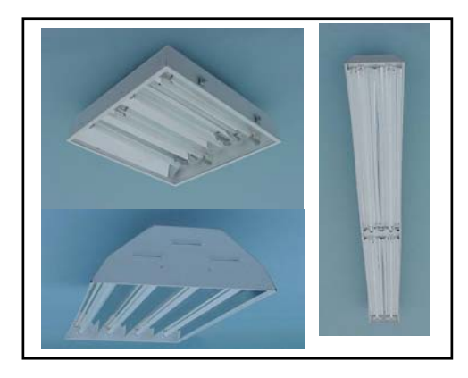
T5 Fixture photos

It is important to note that T5s usually require new fixtures and cannot be easily retrofitted into existing T8 or T12 systems. However, using fixtures specifically designed for T5 lamps optimizes performance and prevents the misapplication of other types of lamps – a common problem with T8 systems. Compared to metal-halide systems, T5s offer better lighting quality due to a higher color-rendering index, better light distribution, and lumen maintenance.