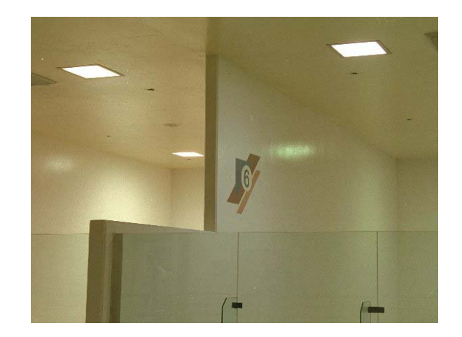
Photos of a racquetball court. Note how much brighter the court is after the T5HO system retrofit (shown on the left side).