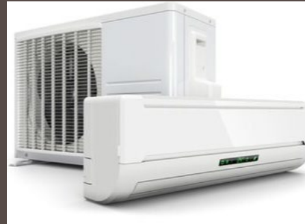
Split AC system