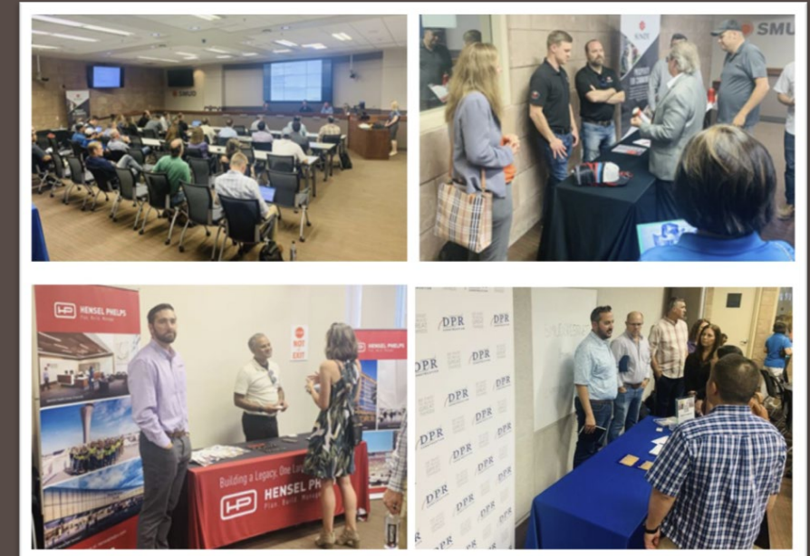
RFP Pre-Proposal Meet the Primes Conference 53 participants, 22 SEED vendors.