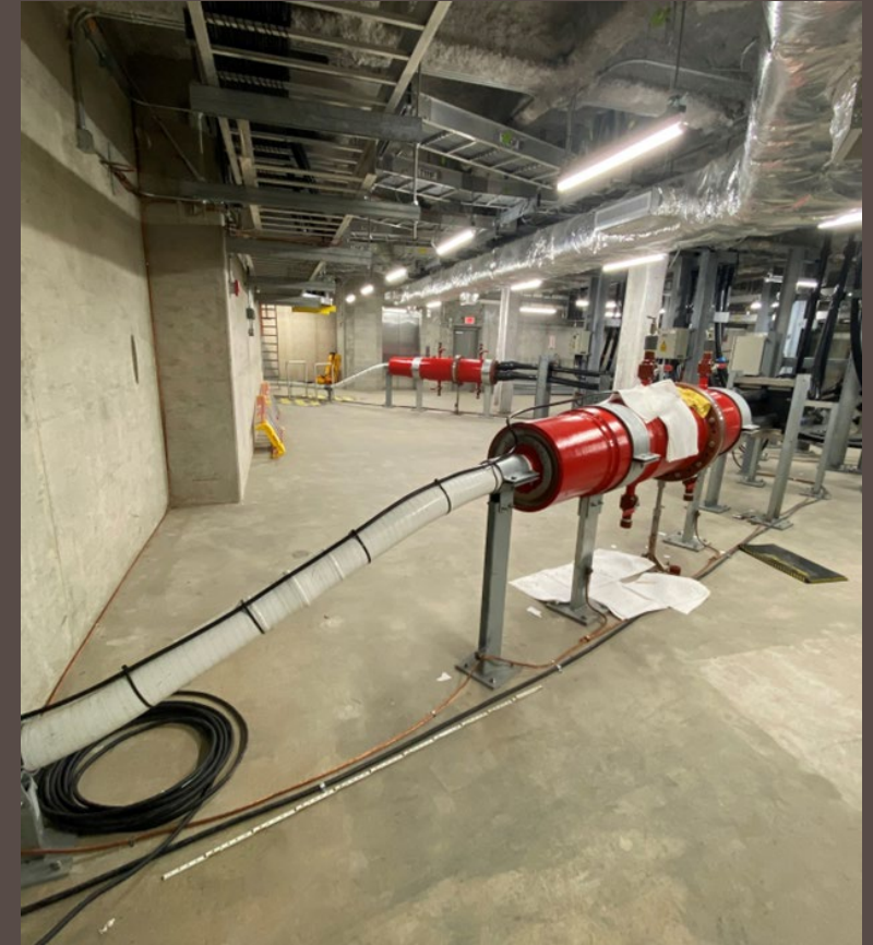
Basement of Station G Line 1 cable transition joint failure