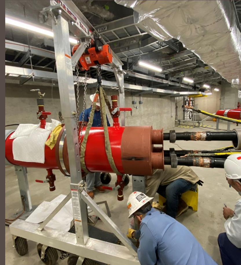
Transition Joint Line 1 Fault in Basement of Station G