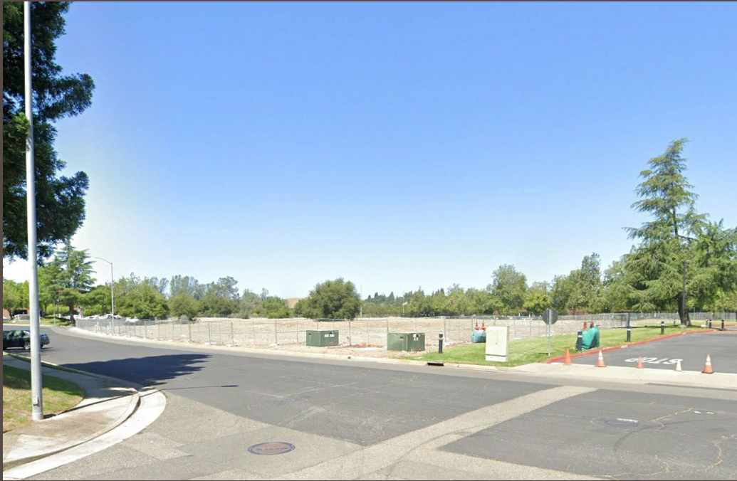
View of existing vacant project site from the Woodmere Rd./Lake Forest Wy intersection (facing northwest)