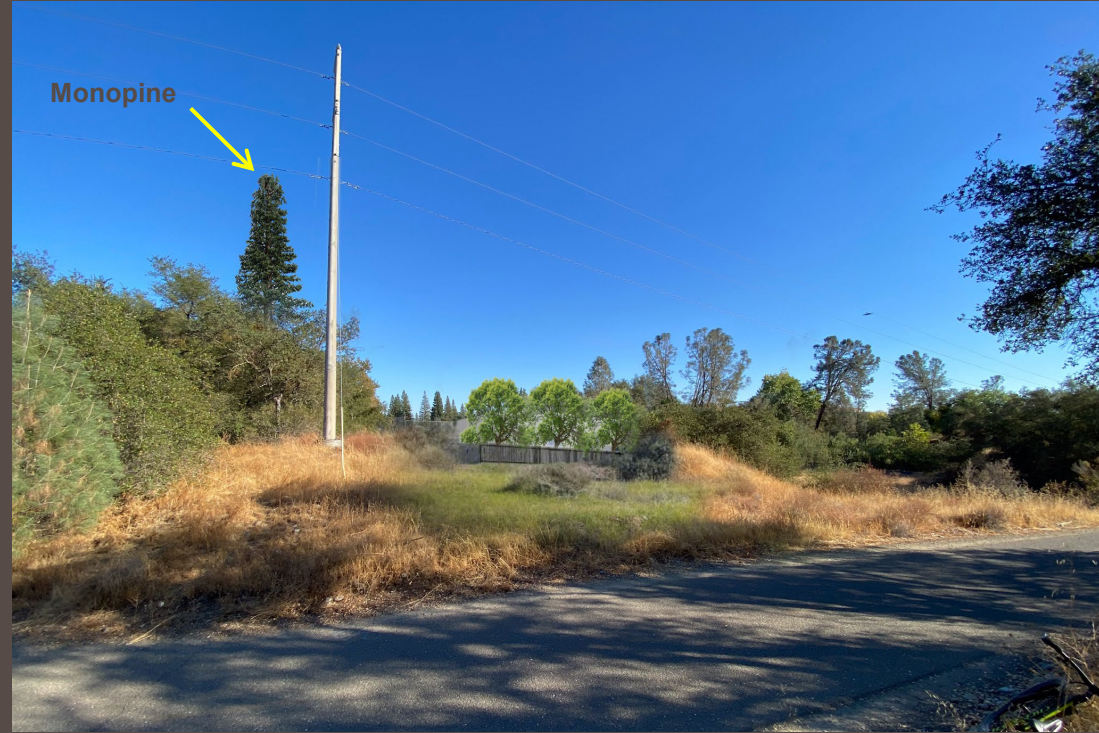
View of architectural rendering of the project site at full conceptual buildout and screening trees at 15 years