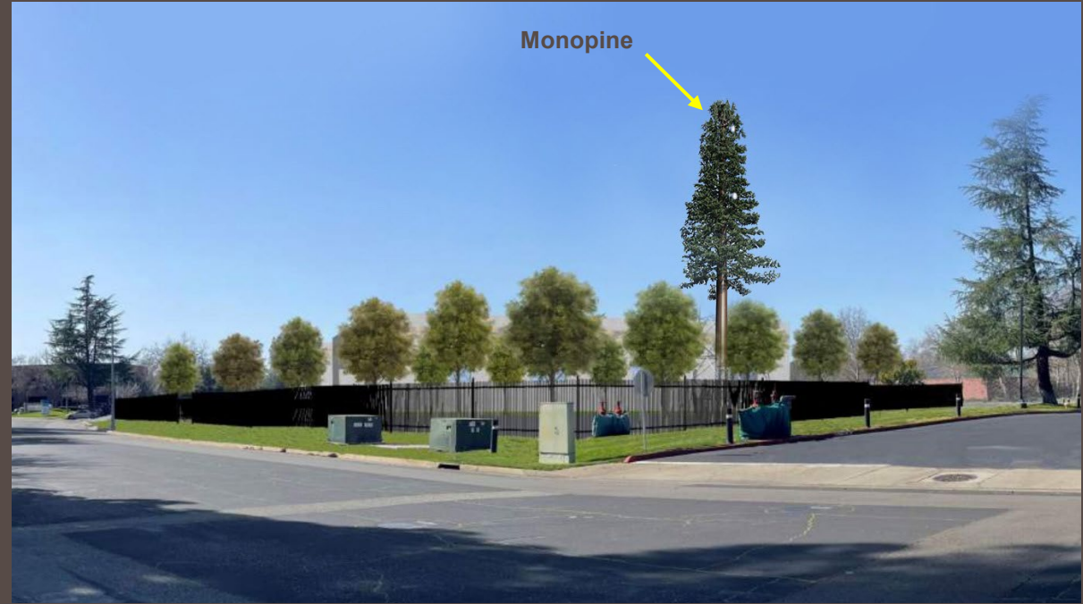
Architectural rendering of the project site with conceptual building, landscaping, and monopine tower