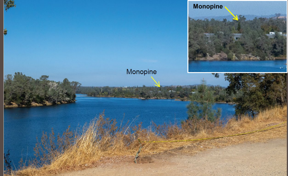
View of existing condition facing northeast from scenic overlook along the American River bike trail located approximately 1.2 miles from the Project site