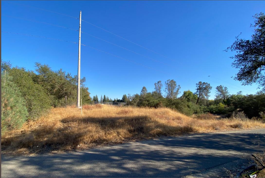
View of existing vacant project site from the adjacent American River bike trail to the west