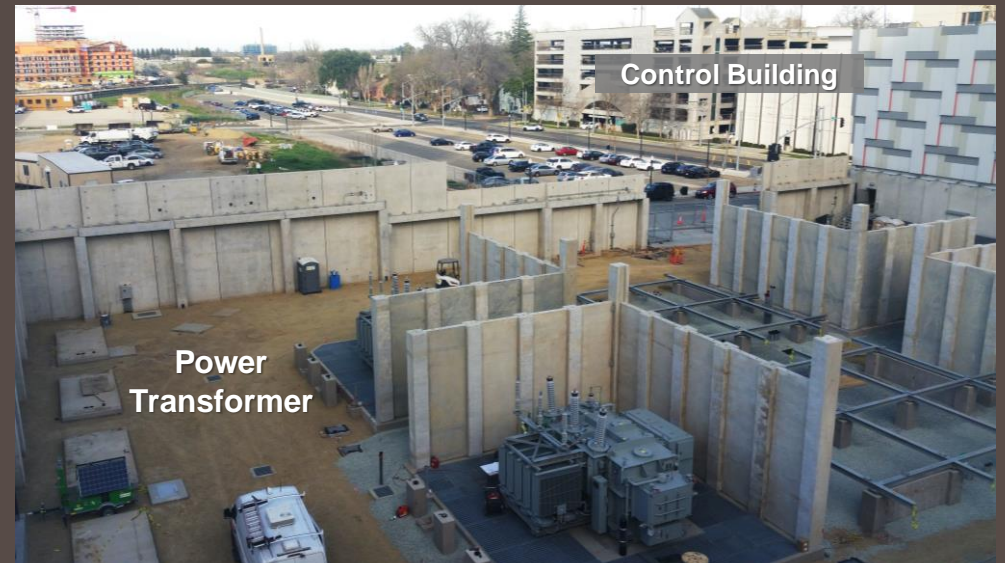
Station G Substation Construction in Progress