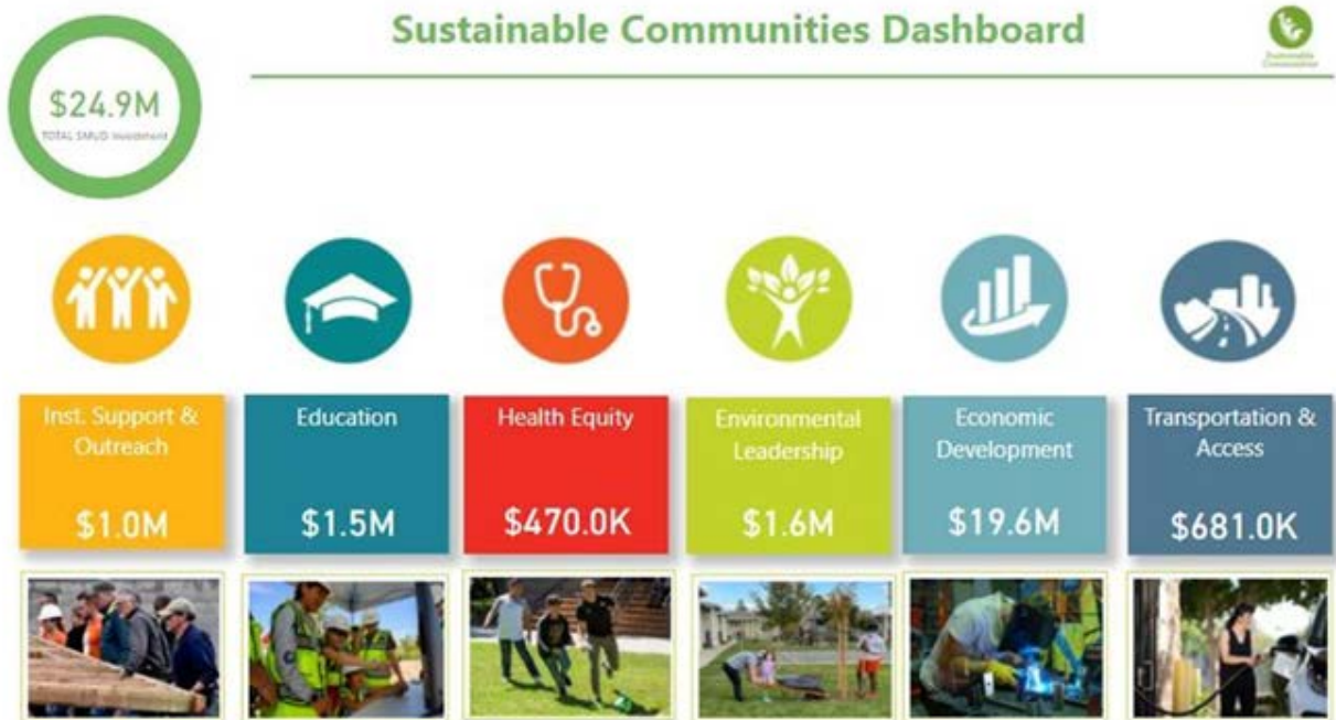
SMUD's Sustainable Communities Priority Map