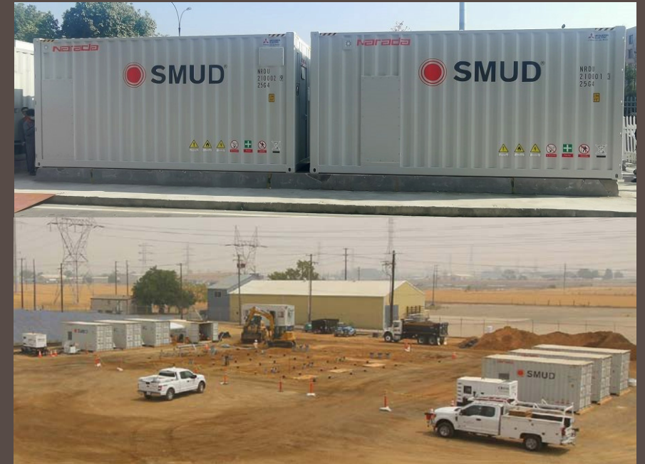
Hedge Battery Storage Units on site