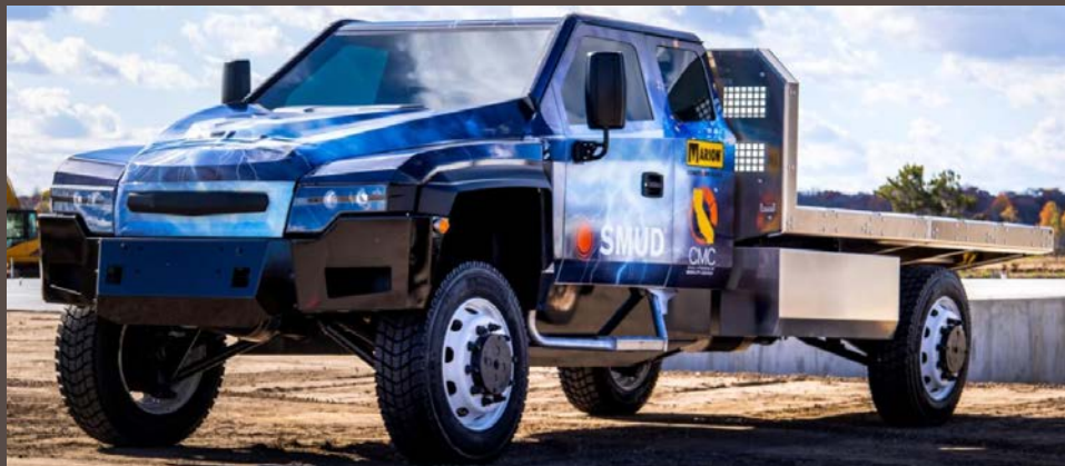
Zeus Chassis Medium-Duty EV with SMUD Wrap