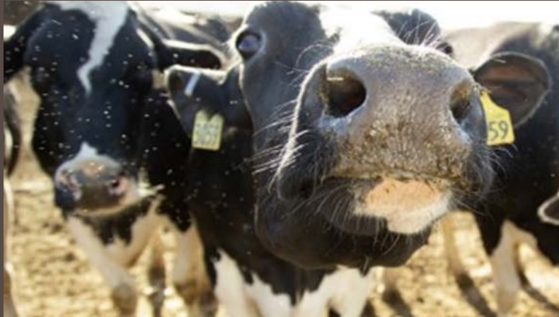
LCFS Credits and biofuels storage from dairy digesters