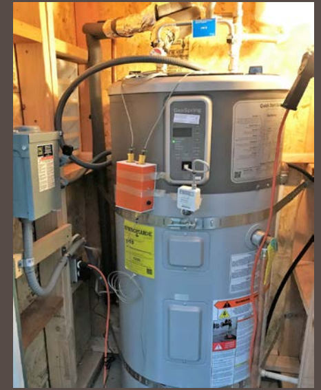
IoT Heat Pump Water Heater