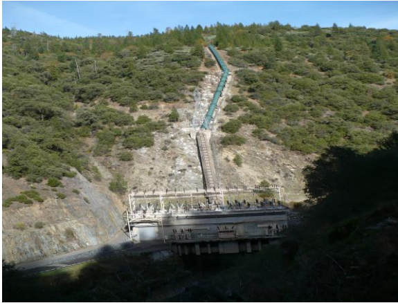
Penstocks - Foundations and penstocks shift over time, requiring remediation