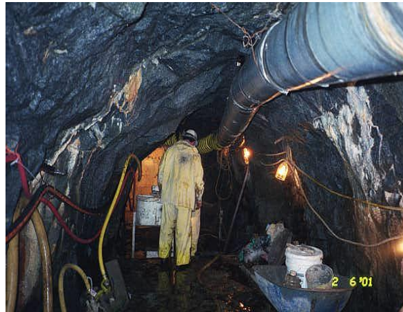
Tunnels – condition assessments and characterization tools allow better maintenance and system reliability