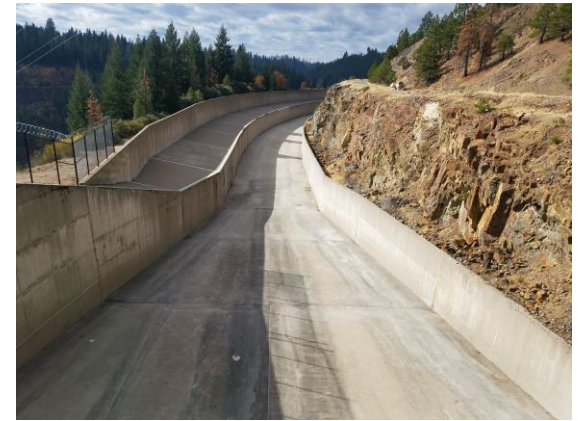
Dam spillway assessments – Increased agency interest = more detailed inspections