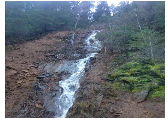
Soil erosion – larger and more frequent weather events requiring repairs and more robust designs