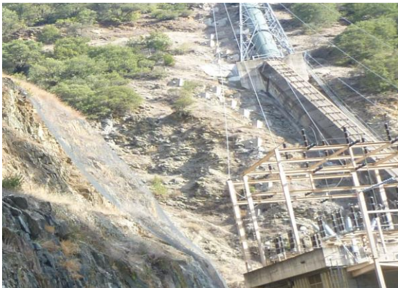
Rock fall protection – weather extremes are requiring greater protection of assets