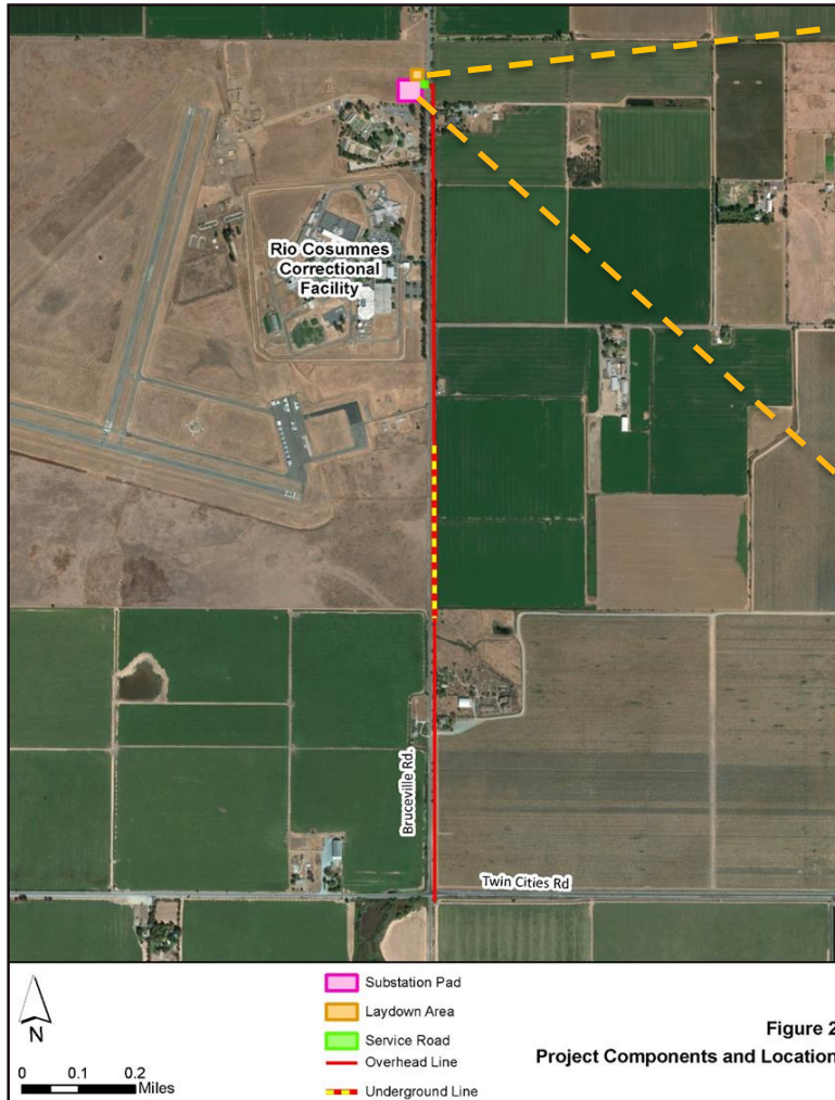
Figure 2 Project Components and Location