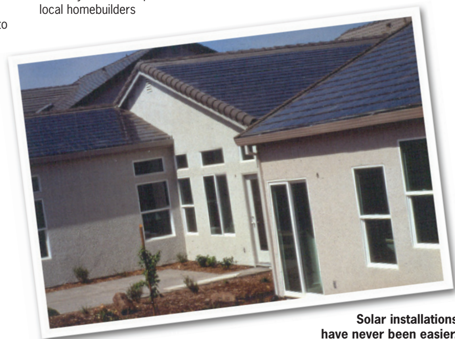
Solar installations have never been easier.

For more information about SMUD solar programs, visit www.smud.org .